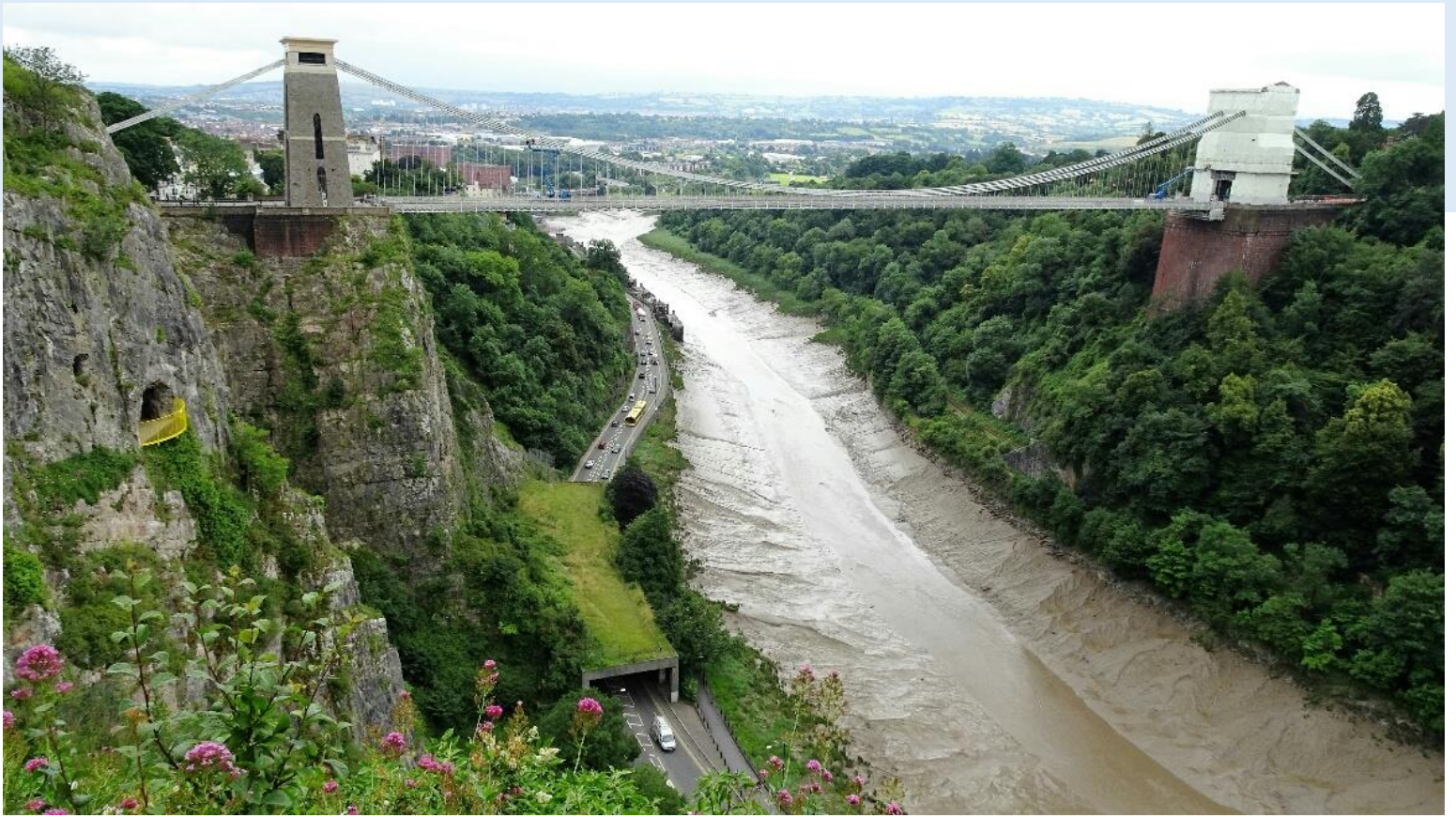
Clifton Suspension Bridge