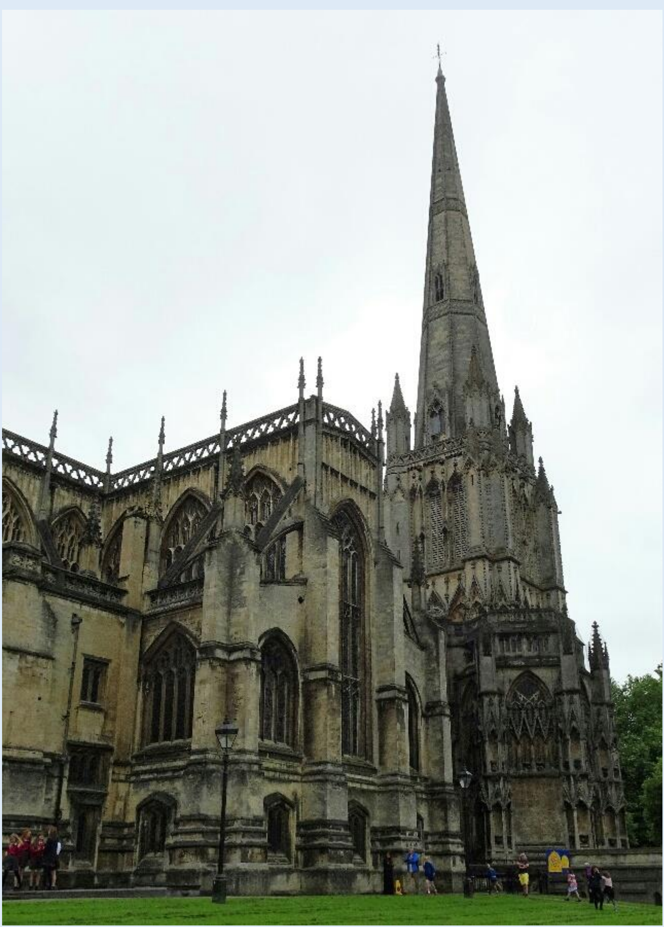
St Mary Redcliffe