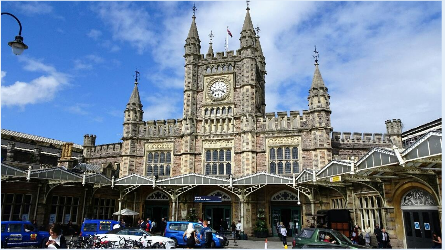
Bristol Temple Meads

Nearby is Bath named for its 2000-year-old Roman Baths. Other attractions include the 1499 Bath Abbey, Pulteney Bridge and the unique Royal Crescent homes.