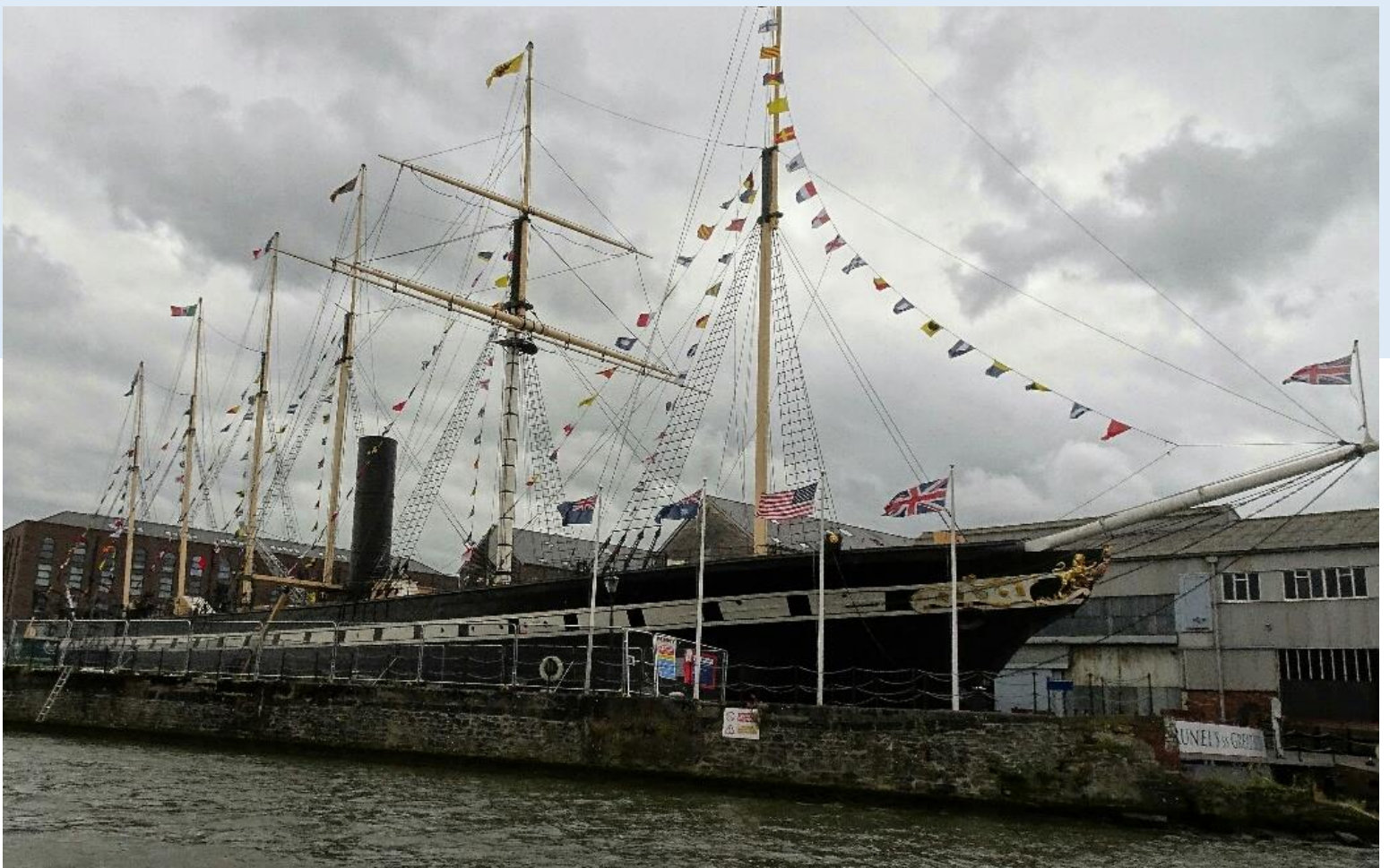
SS Great Britain