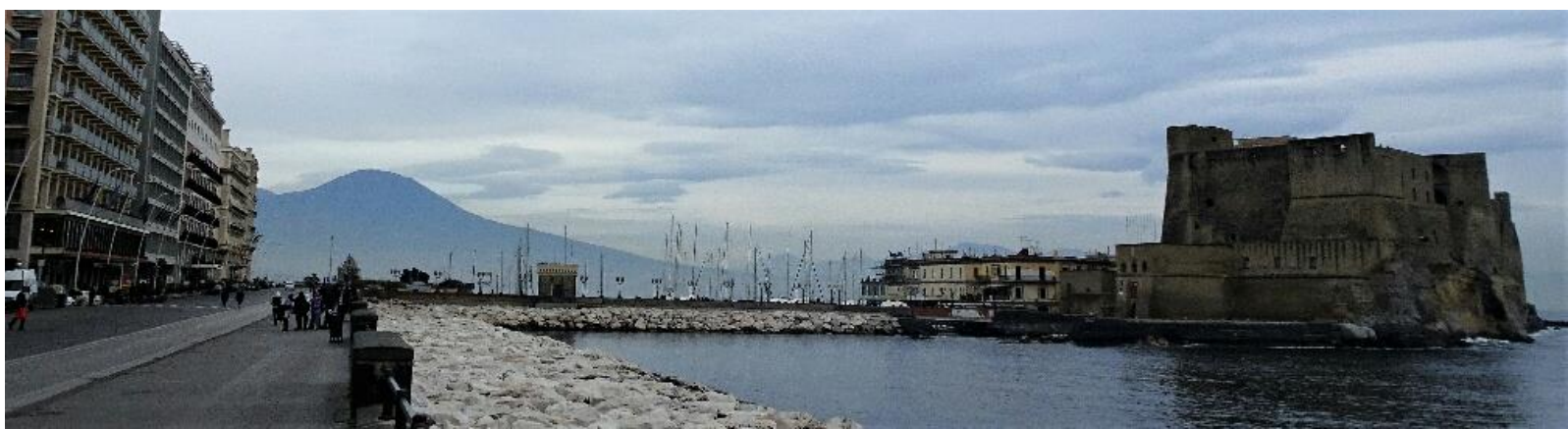
Naples – Mount Vesuvius