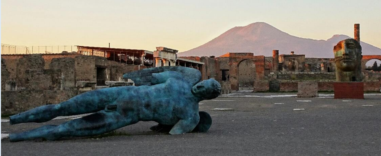
Pompeii – Mount Vesuvius