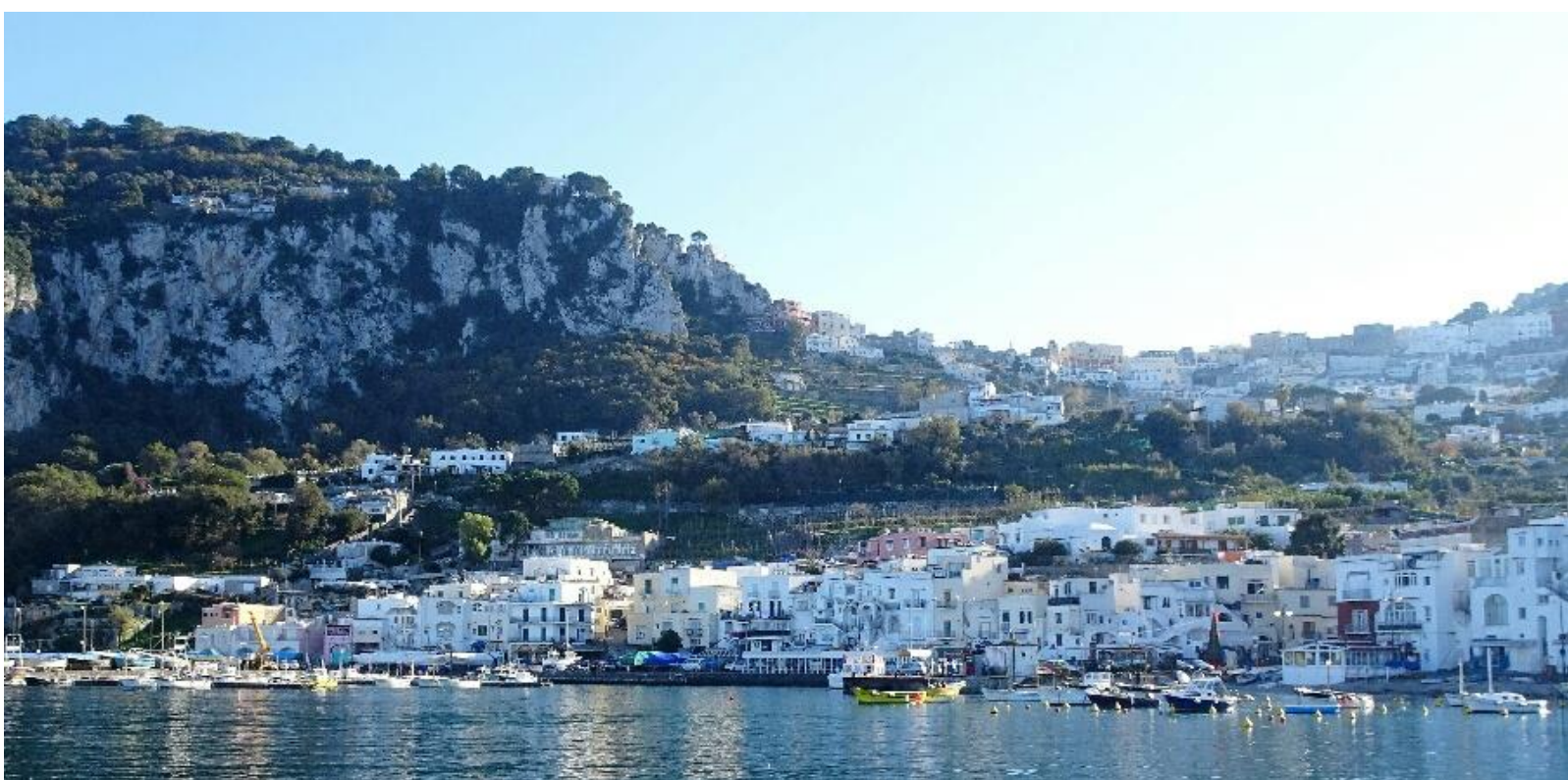
Isle of Capri