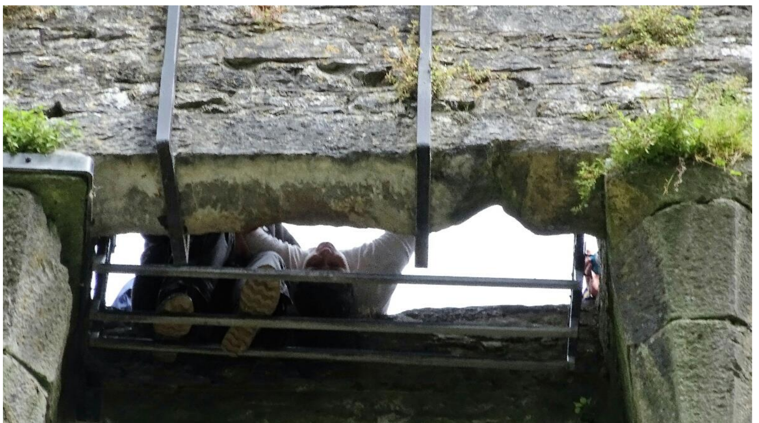
Kissing the Blarney Stone