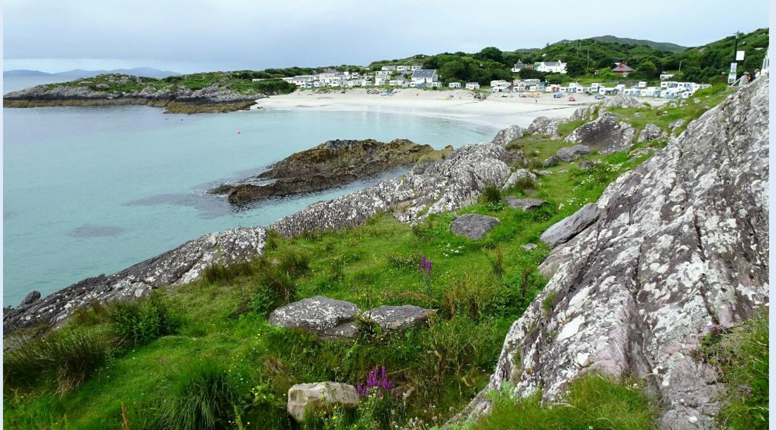
Ring of Kerry