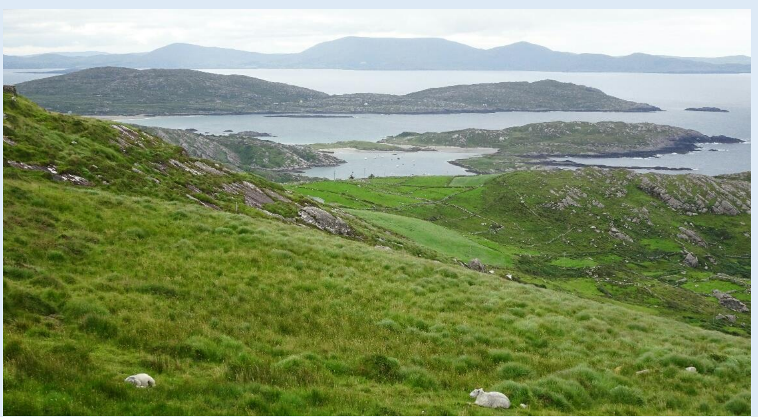
Ring of Kerry