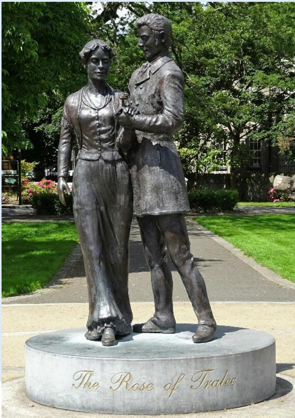
Rose of Tralee

August 2016: Travelling by car our first night was in Tralee. After a morning trip to the tip of the Dingle Peninsula we start our travels on the Ring of Kerry, a 125-mile horseshoe around the Iveragh Peninsula. This one- and two-lane Road is famous for its natural beauty and quaint towns. At the end of the journey is the city of Cork and the nearby Blarney Castle. No, I didn't kiss the Blarney Stone since I already have the gift of gab.