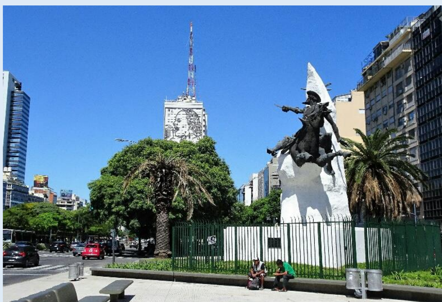
Don Quixote & Eva Peron