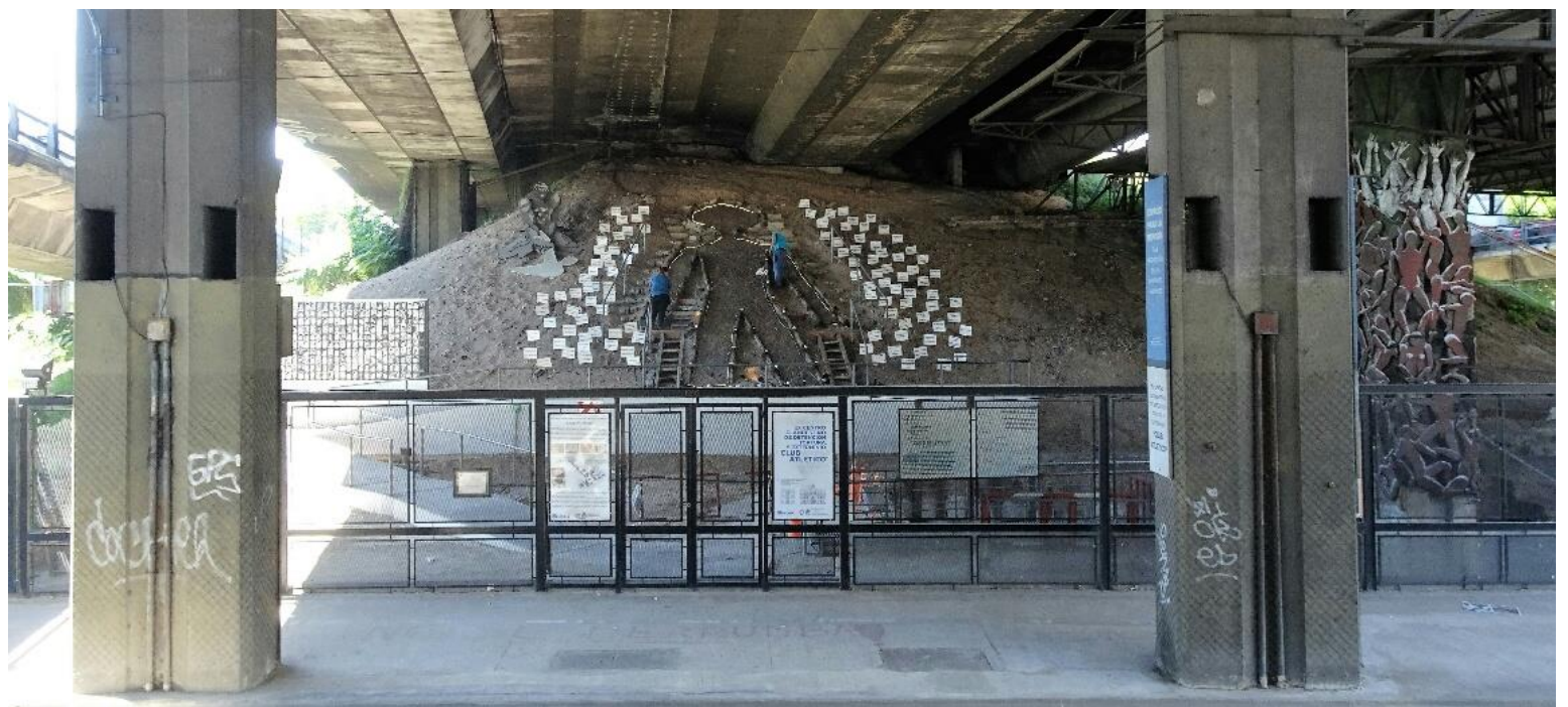
Club Atlético Detention Center