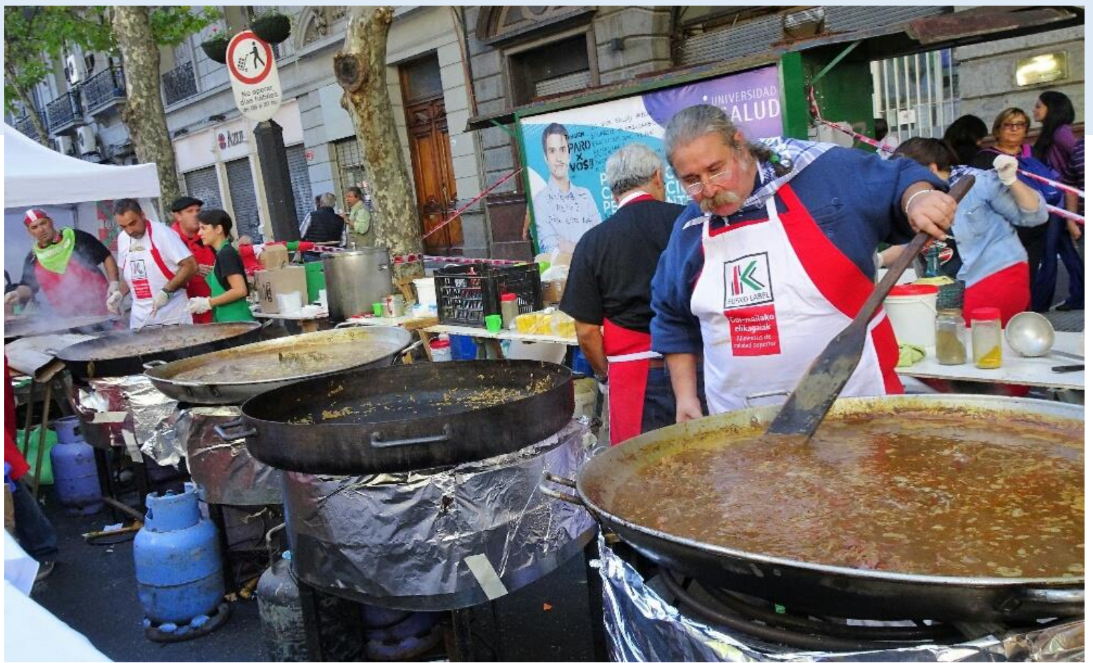
Basque Street Fair