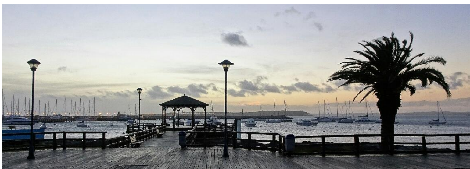
Punta del Este Port