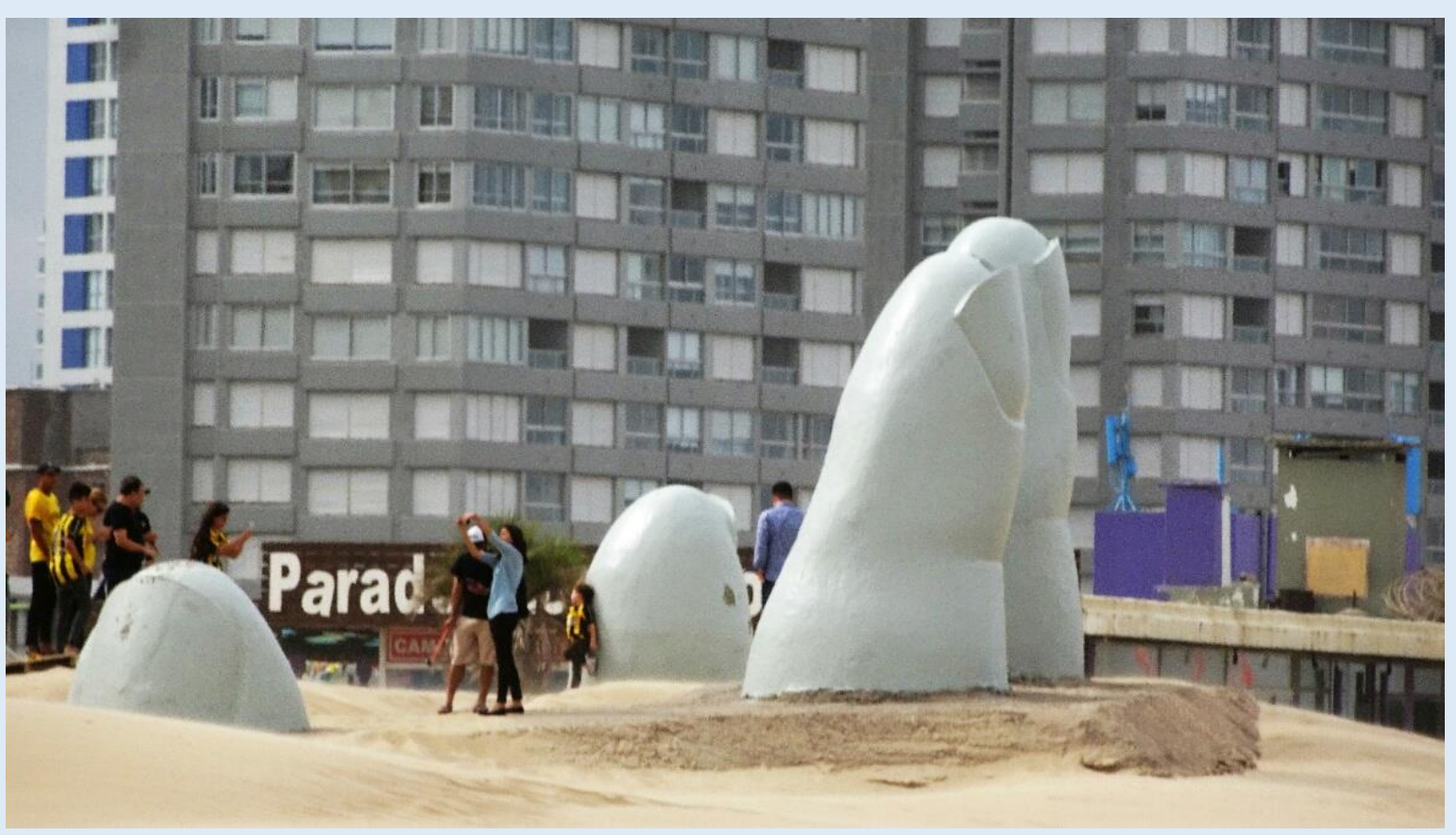
Punta del Este Beach