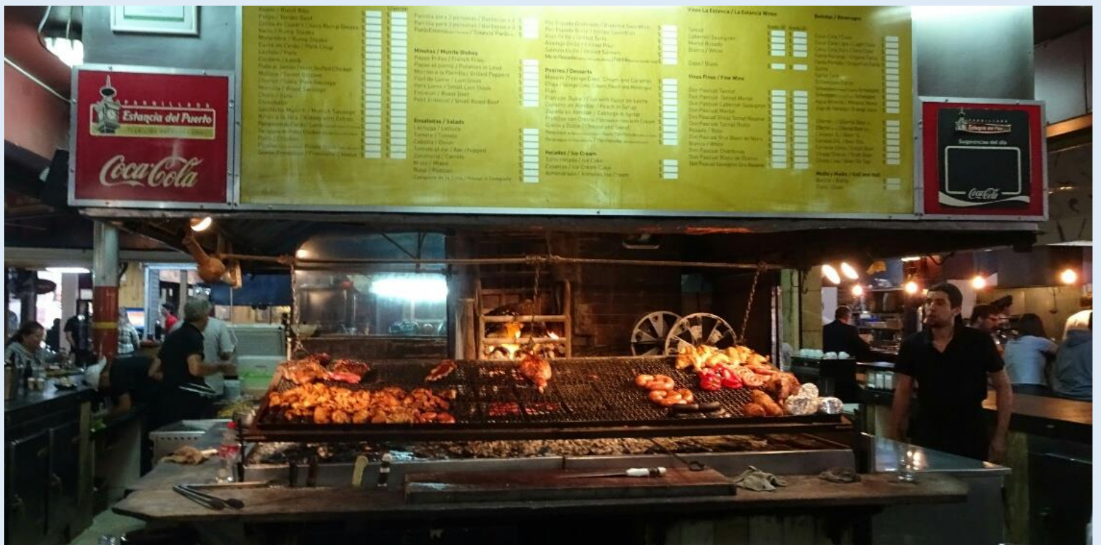
A Grill in Montevideo