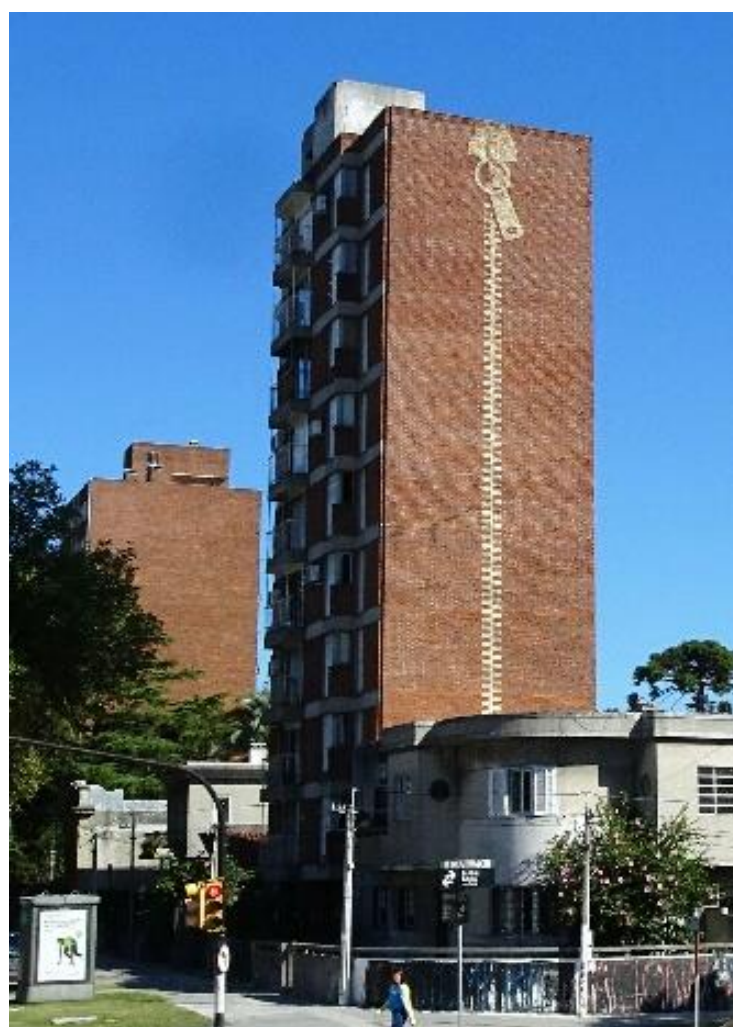
Montevideo Apartment Building