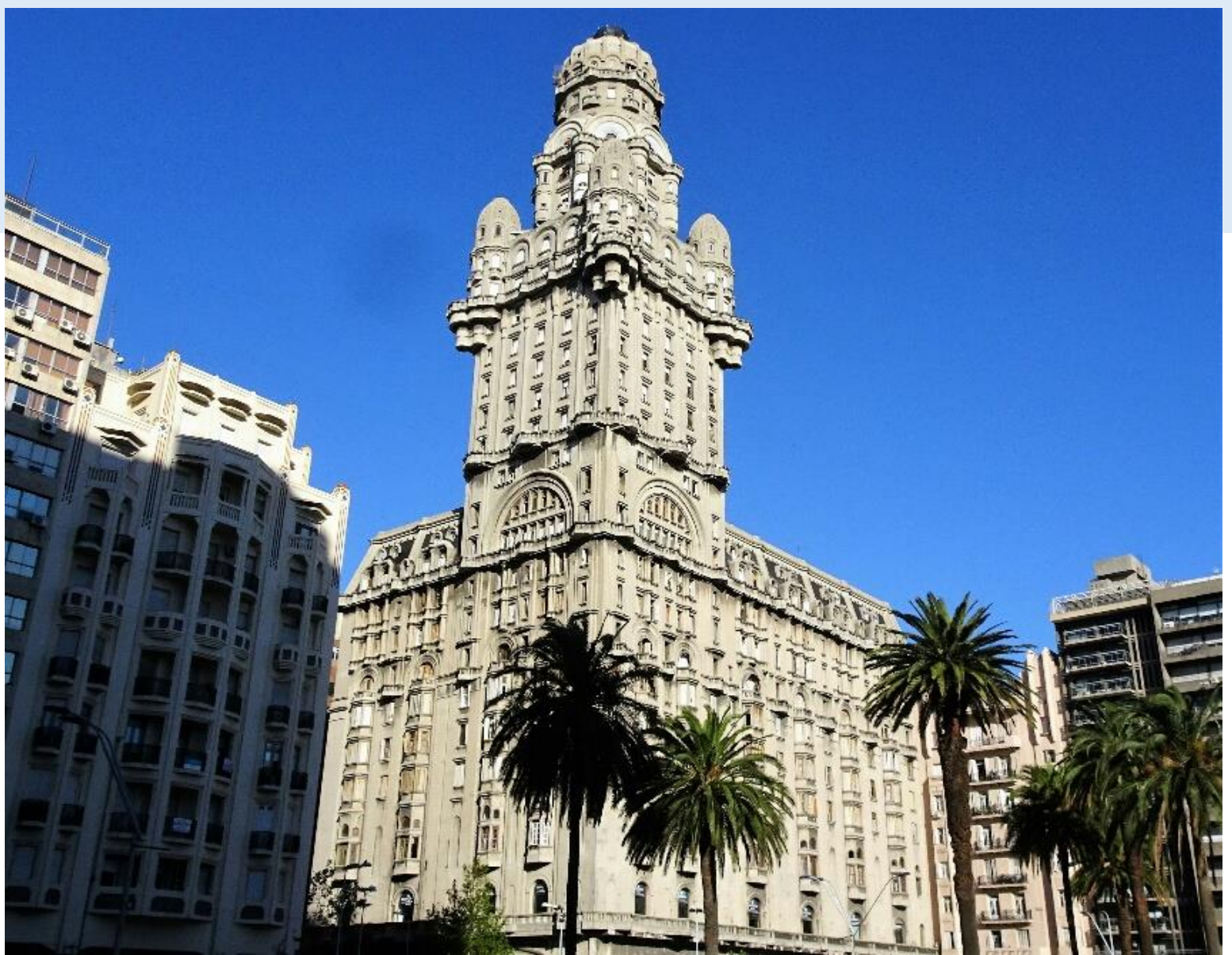
Montevideo Independencia Plaza