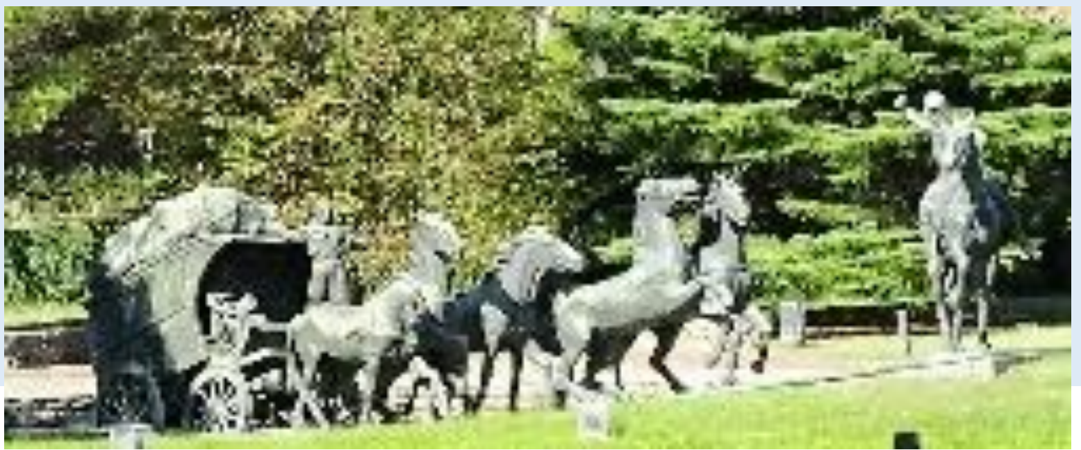
Montevideo Monumento a la Diligencia