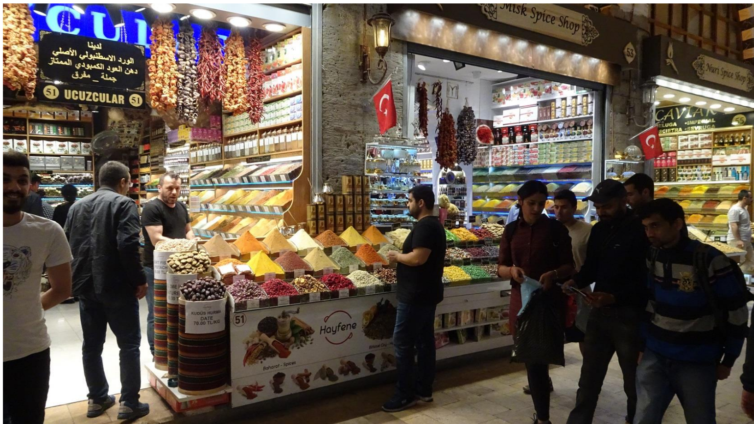
Egyptian Bazaar Spice Market