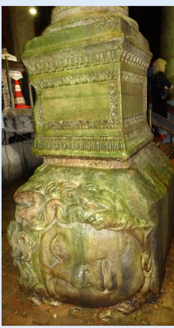
Medusa Head in the Basilica Cistern