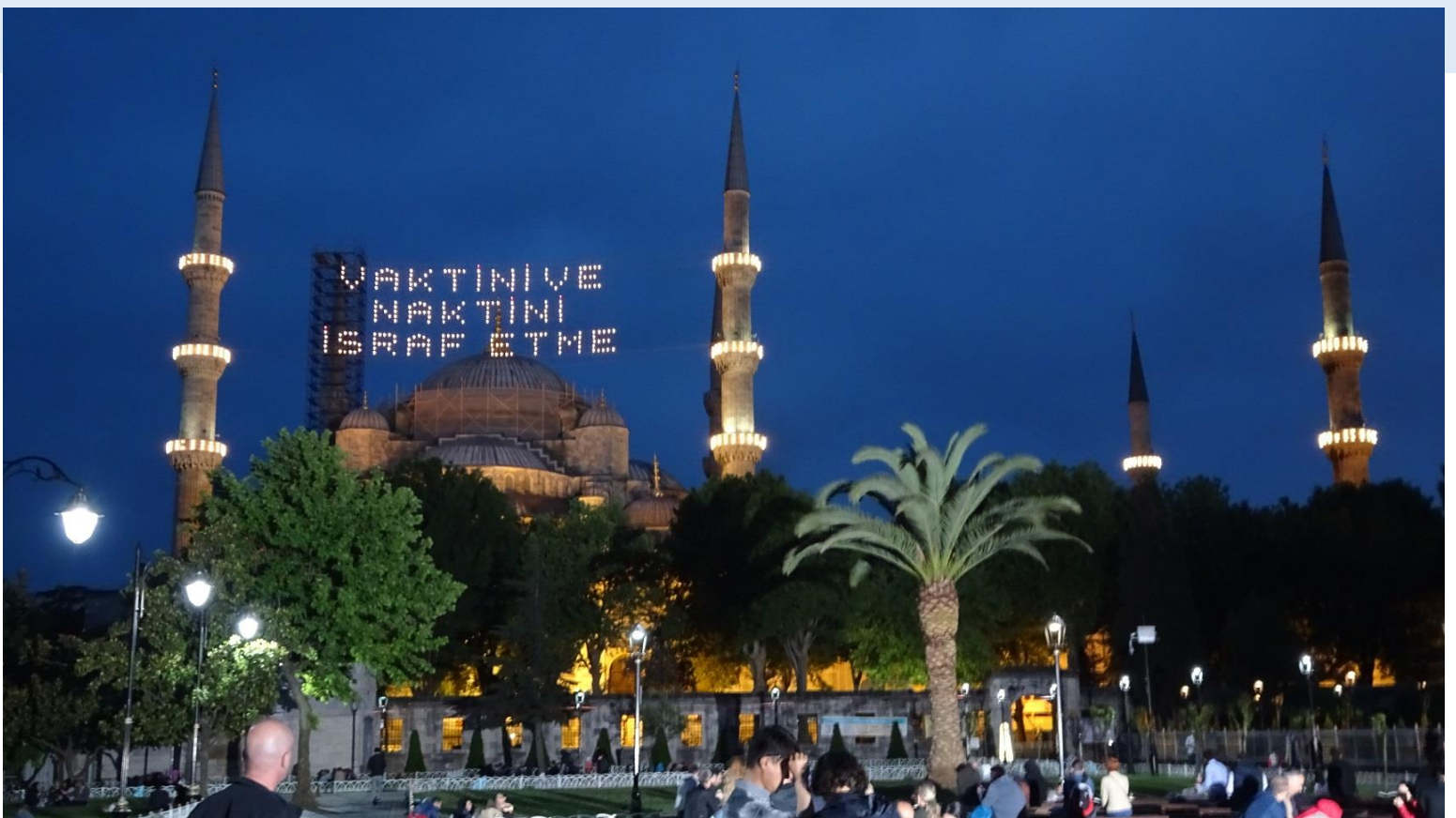
The Blue Mosque